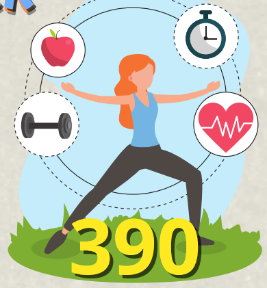
participants across all projects, such as health fairs and workshops