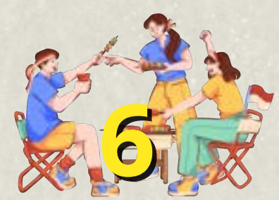
Cook, Meet and Eat sessions on learning numeracy and budgeting through cooking