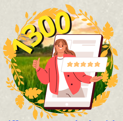
Different cases dealt with, including Immigration, Debt, Benefits etc.