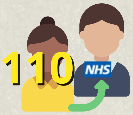
Referrals to NHS Talking Therapies